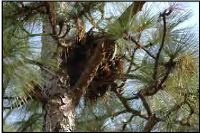
Southern fox squirrel nest in longleaf pine.